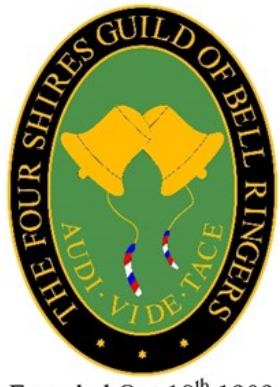
Founded Oct 18th 1909

P14 Subscription and donation payment form